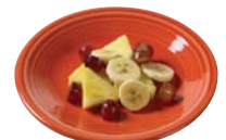
½ cup of fresh mixed fruit

In addition to fruits and vegetables, a healthy diet also includes whole grains, fat-free or low-fat milk products, lean meats, fish, beans, eggs, and nuts, and is low in saturated fats, trans fats, cholesterol, salt, and added sugars.